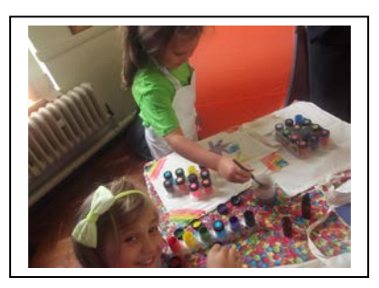
Designing our beach bags